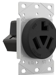
Power Receptacle 10-30r rated at 30A 125/250V.