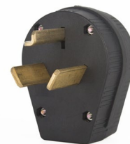
10-30P NEMA Plug rated at 30A 125/250V (common dryer plug)